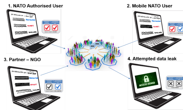
Figure 1: Granular Labelling DCS Use Case Supported by Automatic Sanitization and Redaction.

This work was primarily focused on protecting, controlling and sharing finite data i.e. data of a known structure and size. With knowledge of the data structure, fine-grained granular labelling can be realized. Standardized metadata, particularly related to confidentiality (sensitivity), can be bound to well-defined portions of the data i.e. a paragraph in a document, facilitating operational agility and resource efficiency supported by automatic redaction and sanitization upon access, transfer or release of the document. Figure 1 below demonstrates such a DCS use case.