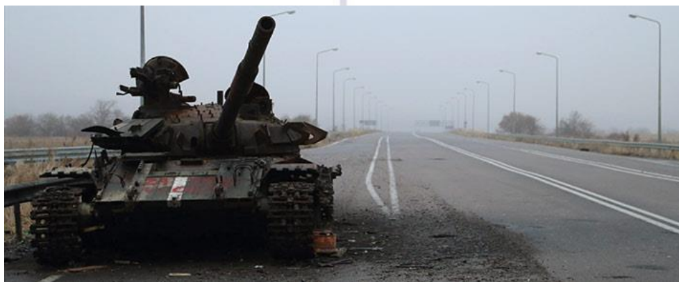
A destroyed tank is seen along a road in Luhansk region, eastern Ukraine, November 19, 2014.