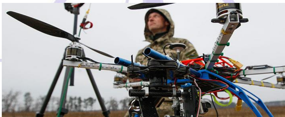
A Ukrainian serviceman operates a drone during a training session outside Kiev, November 6, 2014.

Secondly, we must never forget that public opinion is malleable. For this reason alone, we cannot afford to think naively and argue that lawfare has to rely exclusively on its legal paradigms; the legality and legitimacy of [military] action are first and foremost subject to scrutiny of public opinion. Consequently, any successful counter-lawfare action, or Zeusian use of lawfare, against 'boomerangs' must not be limited in scope, but comprehensive and holistic, as it will have to aim at establishing the right perceptions among the internal and external public opinions.